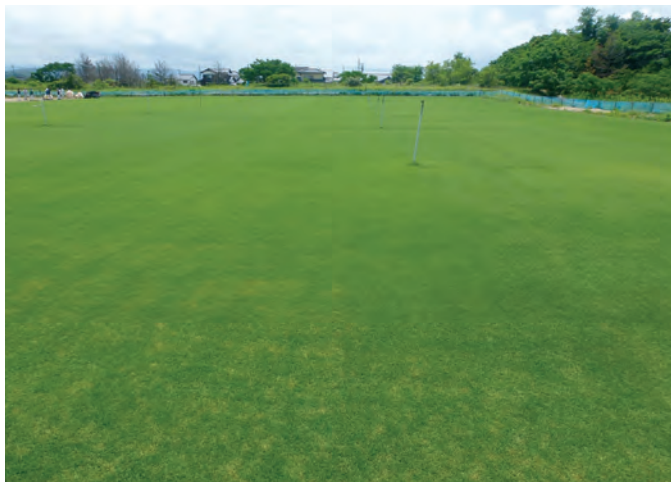
The Chubu Co. built a new, dedicated, sand-capped field in Hokota City strategically located just 68 miles away from the National Stadium.