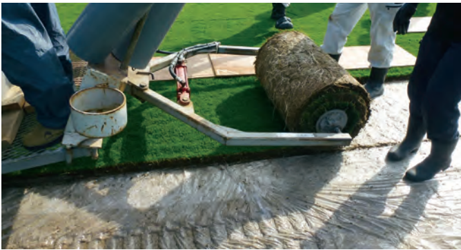
Harvesting is underway at the Hokota field.

Throughout this entire process of multiple resoddings, the goal of the Chubu Co. was to provide the best possible surface to support the athletes. We, as a company and as individuals, were honored to have the opportunity to show the benefits and beauty of natural grass to a world-wide audience.