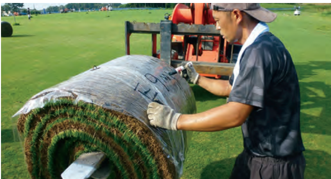
A crew member marks the length of the sod roll on the wrapping film.