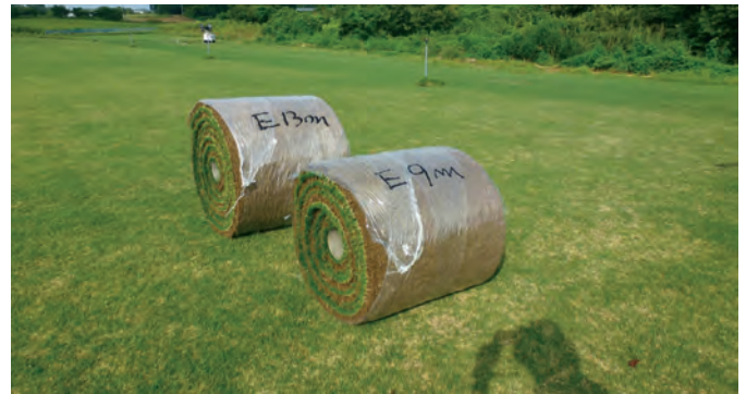
The harvested rolls with the roll length written on the wrapping film are ready for loading.