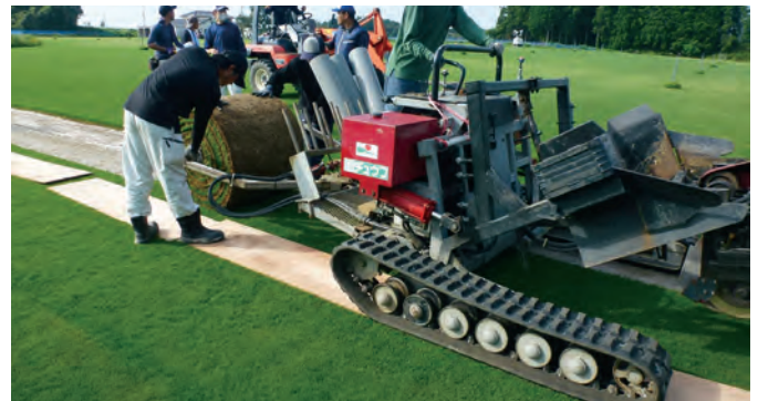
The harvest of this big roll is nearly completed.