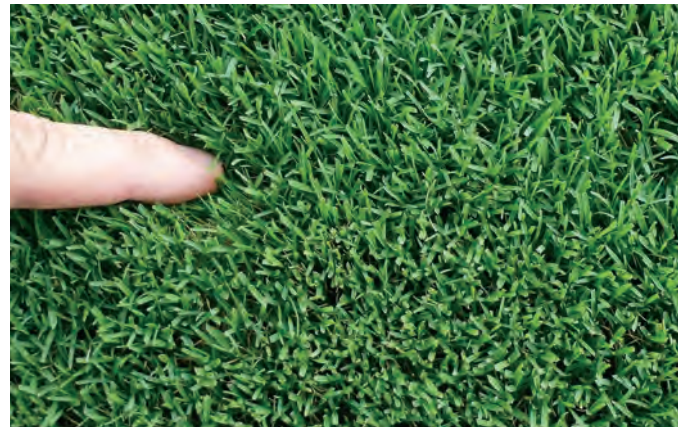
Density was a key characteristic of the grasses selected for the Japan National Stadium.

Even though this “Arafes 2020 at National Stadium” had no audience due to the Covid-19 restrictions, the field had been damaged by the traffic related to this event.