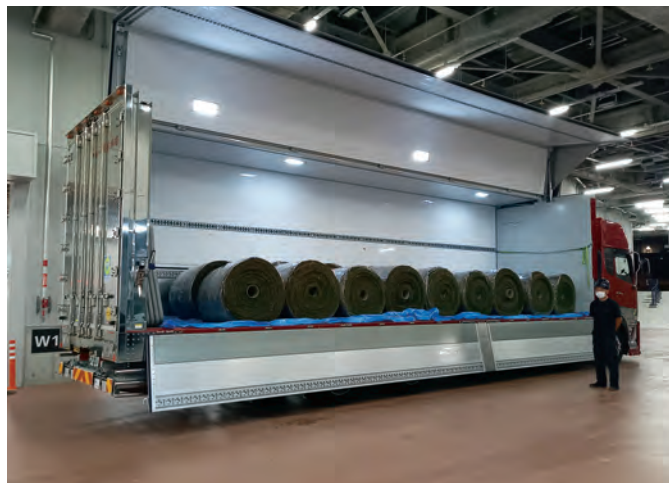
The harvested sod arrives at National Stadium, ready for the installation to begin.

Harvesting the thick cut “Tifton” big roll sod started at the Hokota field at approximately 5 pm and was completed around 5 am the next morning. As the harvest of each roll was completed, crew members marked the length of that roll on the surface of the plastic wrapping film so that the installation crews could identify the length at a glance to enable more efficient installation.