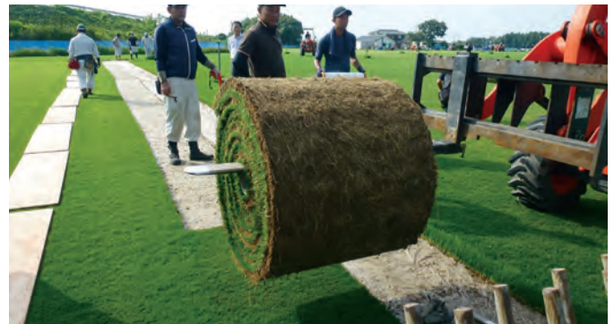
One of the big rolls of harvested sod is picked up by the forklift.