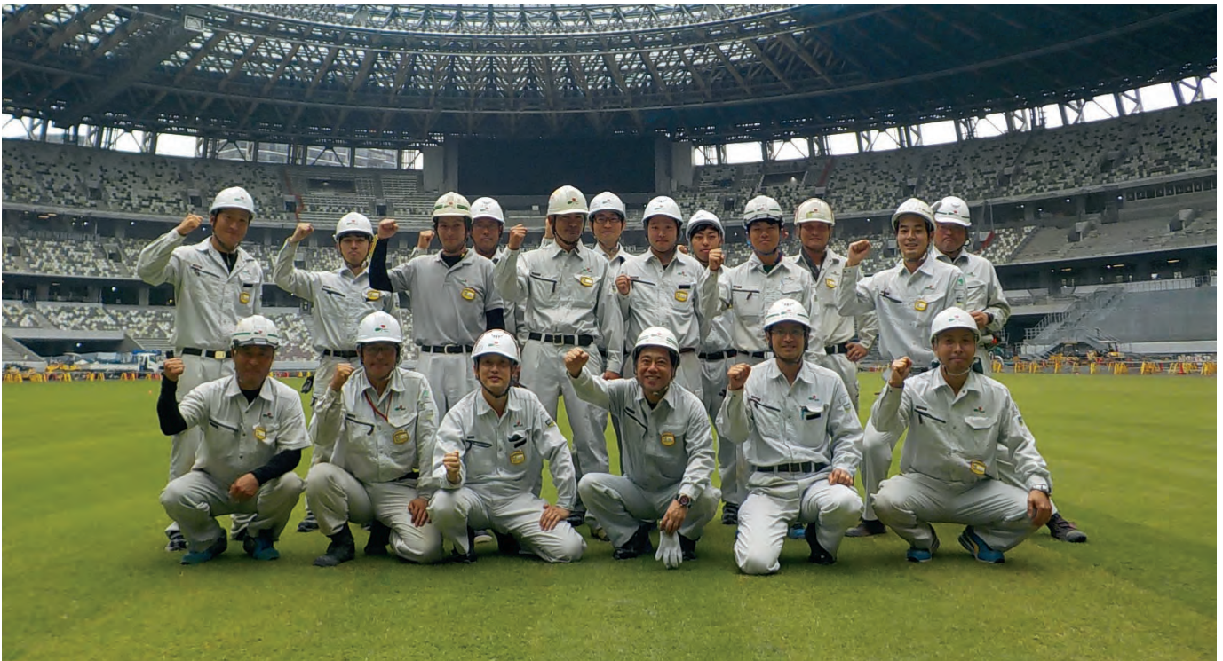
The Chubu Co. crew members involved in the resodding projects pose for a photo on the field of Japan National Stadium.

This certified TifGrand Bermudagrass had been scheduled to remain as the field surface at the Japan National Stadium after the Paralympic games had been completed. However, due to the physical surface damage to the field caused by the Paralympic games, a fifth resodding was set for October 5, 2021. The big roll sod selected was again the ITGAP-certified TifGrand which will remain as the stadium's field surface.